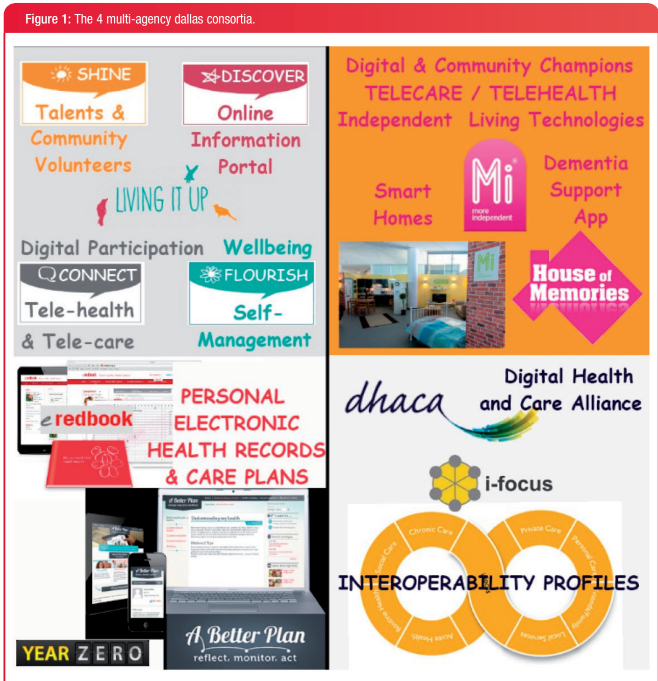
Figure 1: The 4 multi-agency Dallas consortia.

The objective of the present study was to report on the qualitative evaluation conducted, which aimed to identify the barriers and facilitators in the Dallas implementation journey and to share