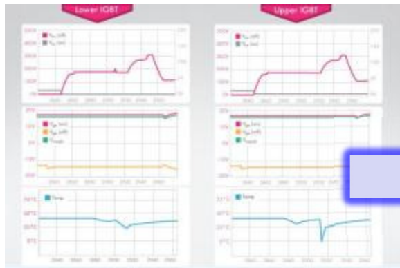
Amantys Power Insight™

Amantys products combine high performance gate driver capability with state of the art real time health monitoring and control